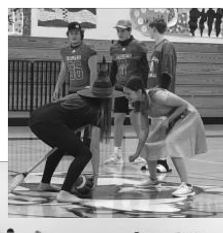
Spirt Week-Games, skits, and pep rally....oh my!